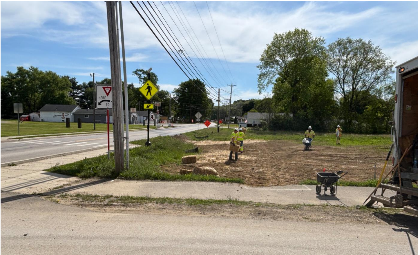
Asphalt Pavement Repairs over 12" Mainline on W HIGH are caught up, maintenance of traffic warning devices in place, sidewalk backfilled level to maintain pedestrian access