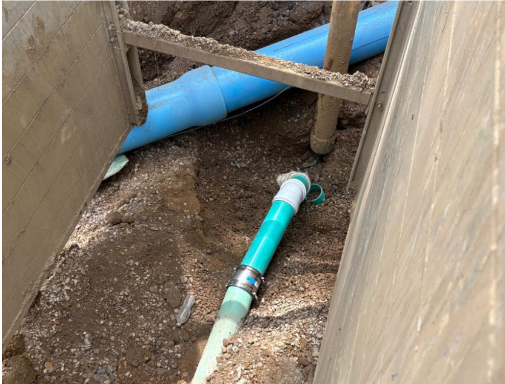
12" Watermain pipe installation turn from DARLA to MEADOW

Repairing any affected drain tiles or Sanitary Service laterals with proper approved materials and verifying slope for drainage before backfill. Crews continue to discuss keeping work areas cleaner as they proceed, picking up bottles etc from site and into trash bags